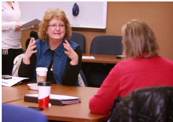
Classic Annie's Project mentoring caught in action at a Minnesota session.