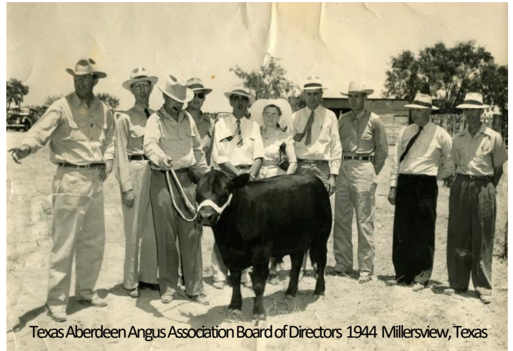
Texas Aberdeen Angus Association Board of Directors 1944 Millersview, Texas